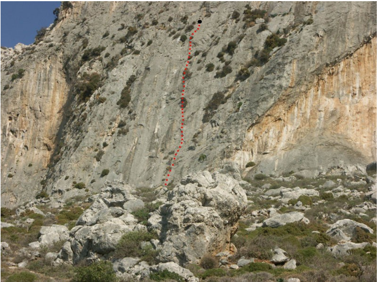
Voie de Ghost Kitchen